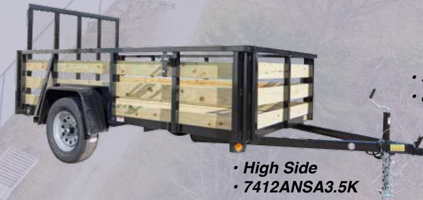
• High Side • 7412ANSA3.5K