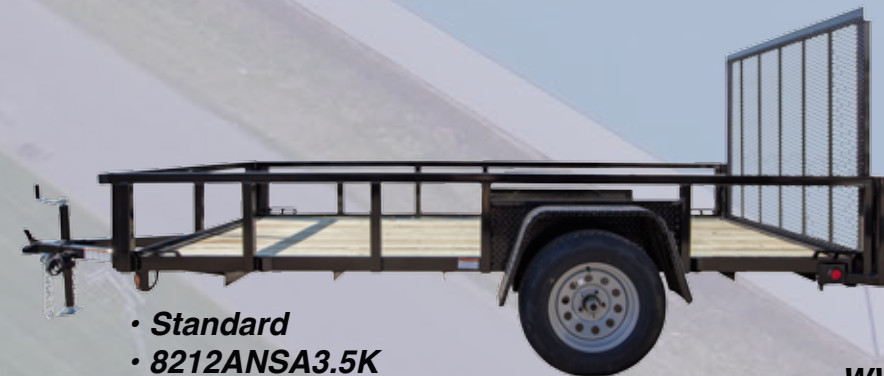
• Standard • 8212ANSA3.5K