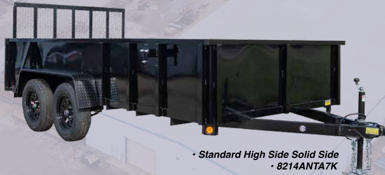
• Standard High Side Solid Side • 8214ANTA7K

2 X 4 TUBE DRAWBARS 2-5/16" A-FRAME COUPLER CENTER DRAW BAR