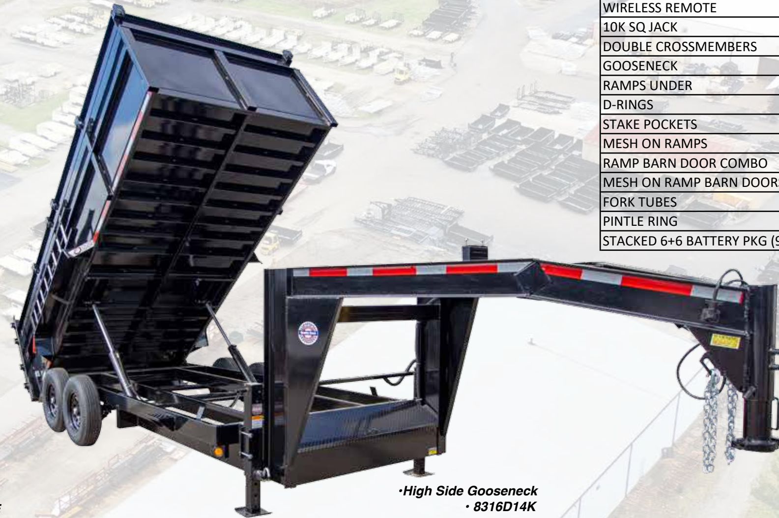
•High Side Gooseneck • 8316D14K